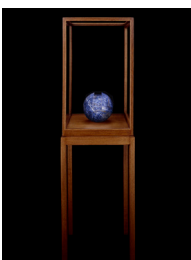
The Sphere with Stairs