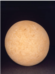
The Tomb of James Lee Byars

James Lee Byars: Sphere Is a Sphere Is a Sphere Is a Sphere